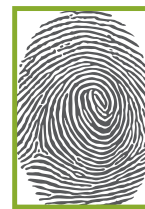
MSO 1300 Series capture